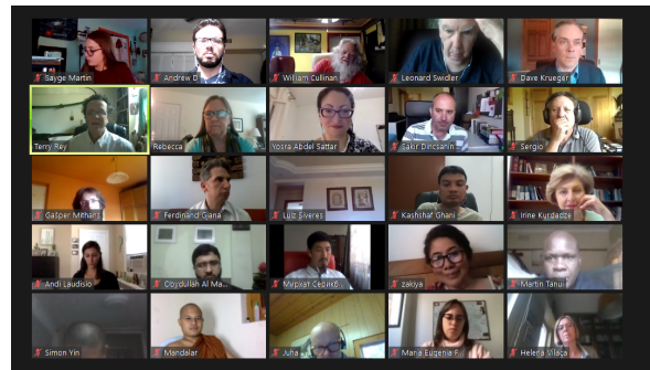
Image: SUSI Scholars engaging in dialogue

The follow-on project also provided funding to consolidate resources for a digital resources library of materials we have used over the years. The program alumni now have access to a collection of lecture slides, tutorials, maps, and articles that contributed to their understanding of religious freedom in the U.S. Finally, we were able to pilot a podcast interview series featuring our SUSI scholars, which can be accessed on our Diablogue.